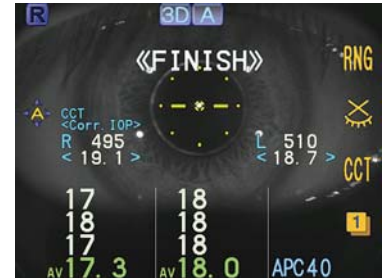
Compensated patient's IOP