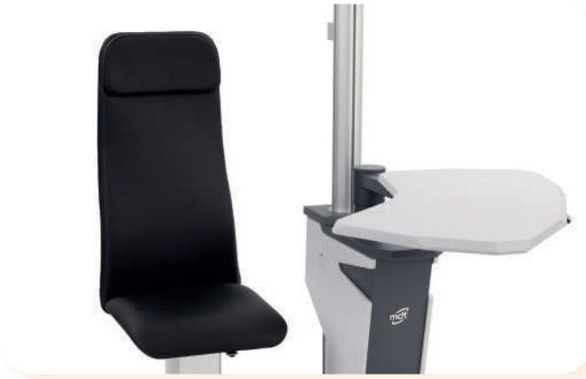
UNIQ with SLIM chair (right-handed setup)