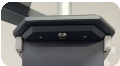
Table top electromagnet lock switch