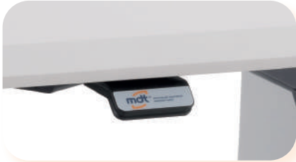
Chair height adjustment switch