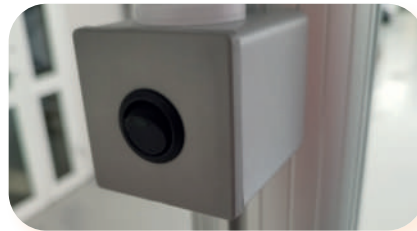
LED lamp switch